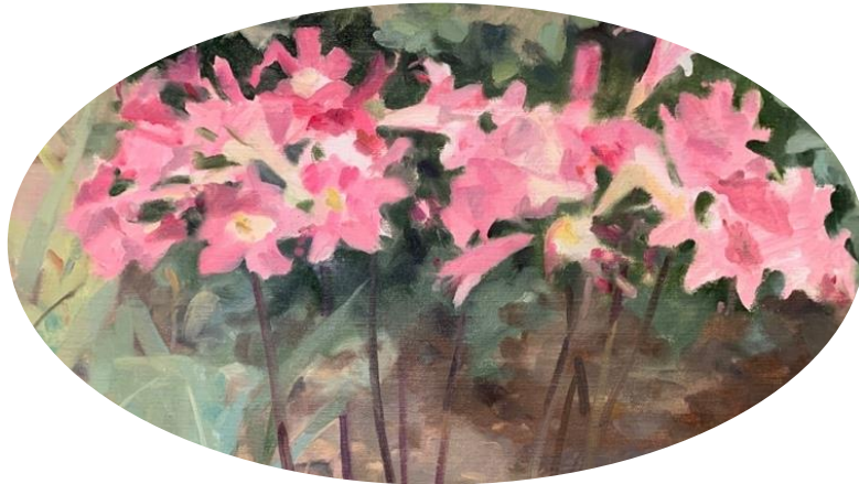
Artwork: Angela Abbott

Your offering will be gratefully received via direct deposit to Account Name: Toorak Uniting Church BSB: 033086 Account Number: 911892