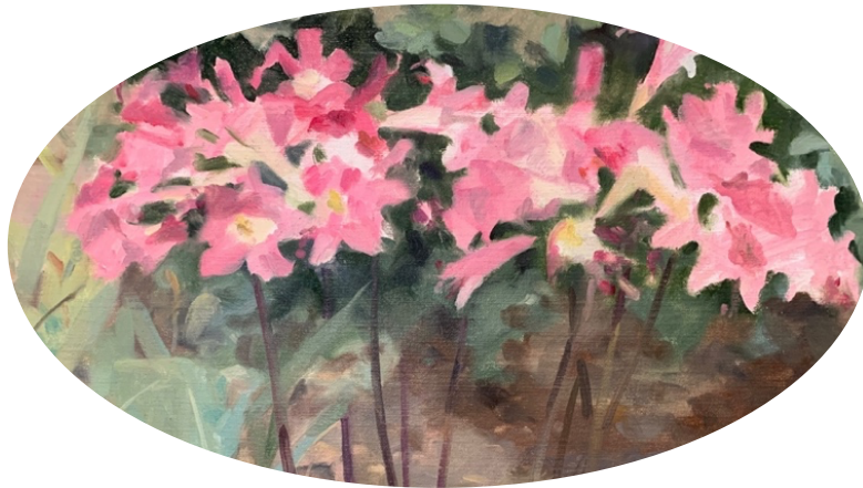
Artwork: Angela Abbott

Your offering will be gratefully received via direct deposit to Account Name: Toorak Uniting Church BSB: 033086 Account Number: 911892