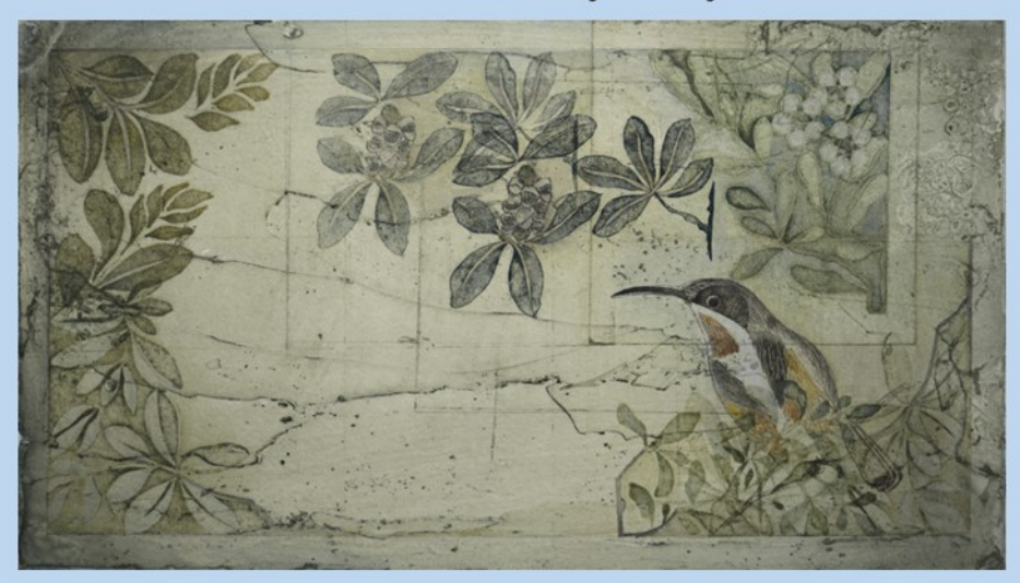
Image Credit: Bronwen Gibbs (2019), Limosna Bird 1 , [multilayered intaglio and watercolour], 22.5cm x 13cm. Courtesy the artist.

Opening Celebration: Friday, May 3. 6-8pm Artist Talk: Tuesday, May 7. 11am